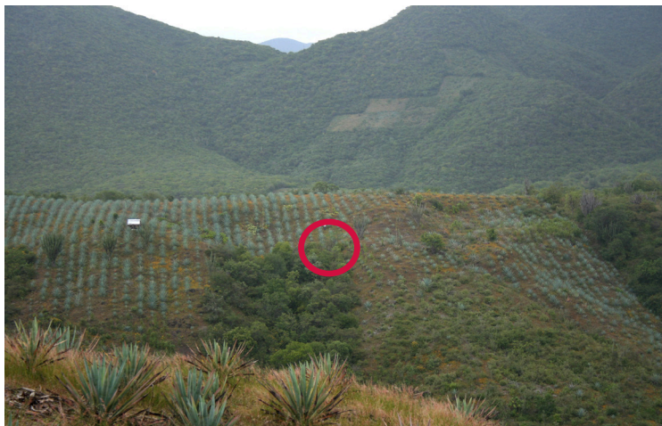
A MEZCALERO IN HIS AGAVE FIELD IN THE MOUNTAINS ABOVE SAN JUAN DEL RIO,