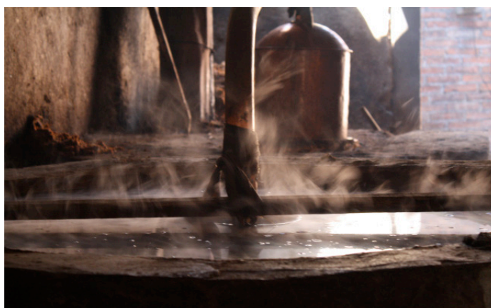
CONDENSER & POT AT SAN BALTAZAR