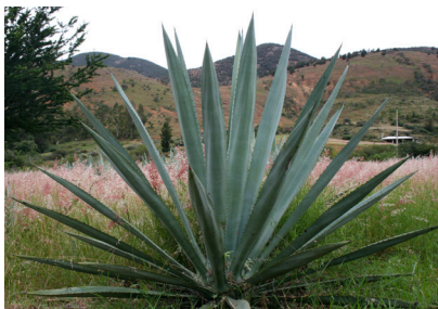
AGAVE ESPADÍN NEAR OCOTLAN

STILL PROOF TOBALÁ – Wild tobalá , bottled as it came from the still.