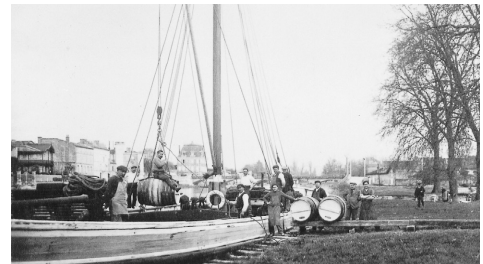
The last cognac ever taken in barrels down the Charente to the sea by boat: loaded in 1935 from the ancienne distillerie in Jarnac.

MAISON SURRENNE is a collaboration between the Germain-Robin and Cognac's largest remaining family-owned producer. Surrenne's eight cellars hold extensive stocks of aged distillates that have been maintained pure and unblended. There are four distilleries, including the ancient installation in the chateau of Triac. The home distillery is on the Quai de l'Ile Madame on the banks of the Charente river in Jarnac.