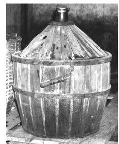
rattan-wrapped demijohn or "bonbon"

Great cognac doesn't need a lot of oak. Flavors should be subtle and delicate, with no hint of harshness. Aromas and flavors should be in balance, with no single element too dominant. Maison Surrenne does not indulge in the usual commercial practices: there's no excessive adulteration by caramel or sugar syrup or boisé (oak-chip) flavoring. Purity, quality, and individual distinction make Surrenne's cognacs a pleasure to experience.