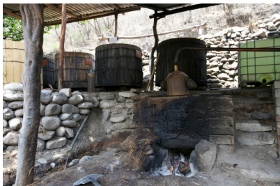
SANTA ANA DEL RIO